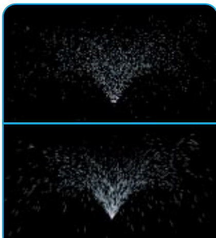
FIGURES 1a AND 1b. 1a shows point rendering and 1b shows a composition of line segments.

I took the simple route. I just drew each particle as a 3D point. If you turn